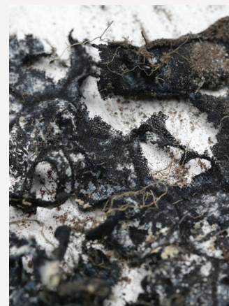
After being buried for six months, the nylon jersey fabric (left) remains relatively unchanged, whereas the wool jersey fabric (right) has significantly biodegraded.